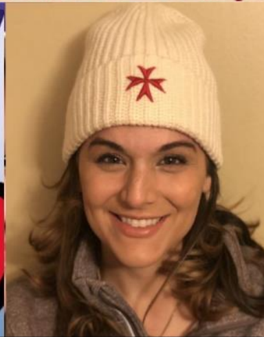
Maltese-Americans in USA