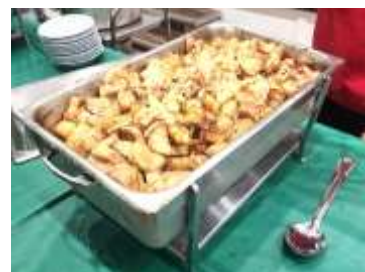
Served with patata l-forn