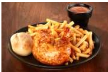
A quarter chicken meal