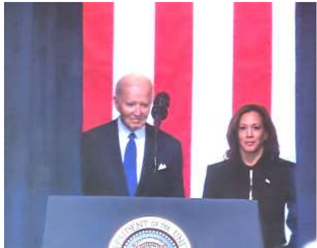
Former President Joe Biden and former Vice President Kamala Harris