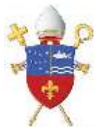
Crest of Diocese of Jundiaí