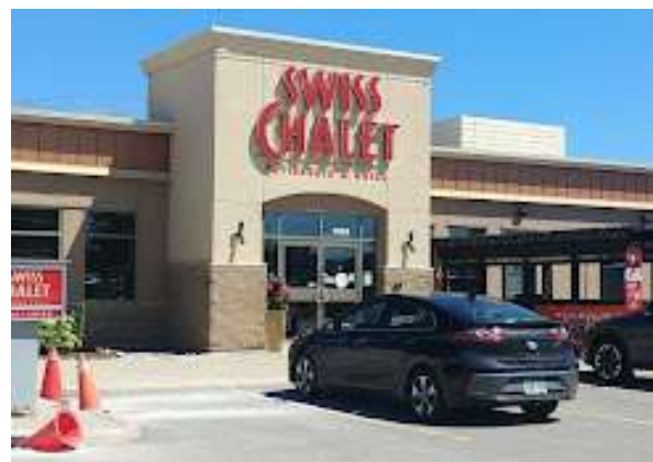
3060 Wonderland Road South