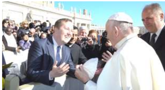
Sergio Gor meeting with Pope Francis, 2016

On a visit to the Vatican in 2016, Gor met with Pope Francis and was given, “a white skull cap that he had worn on his head.”