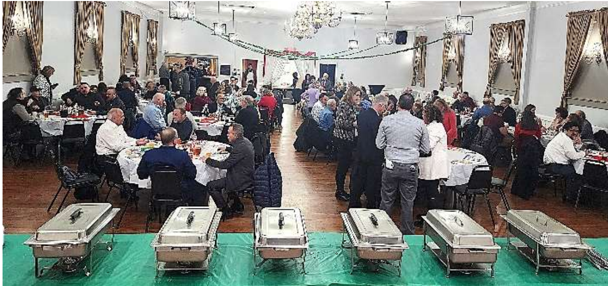
Another sold out event