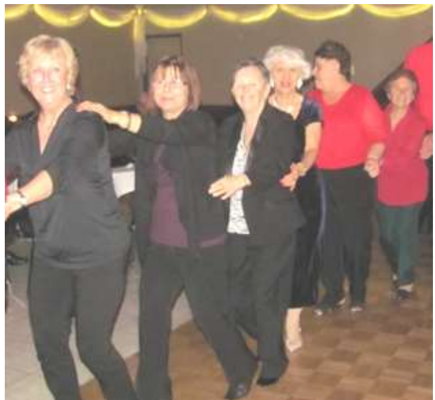
Dancing the night away