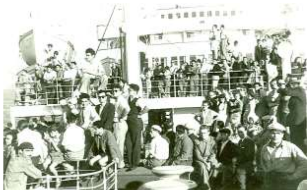
Maltese emigrants on board the Vulcania , June 19, 1948, en route to Halifax, NS