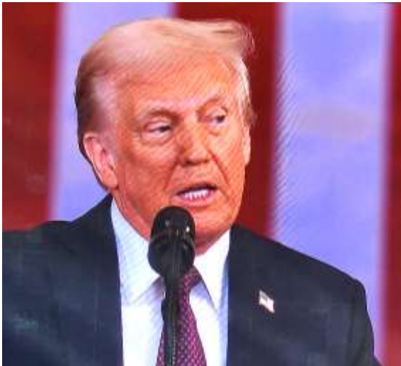
President Donald J. Trump