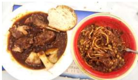
My rabbit dinner, yummy