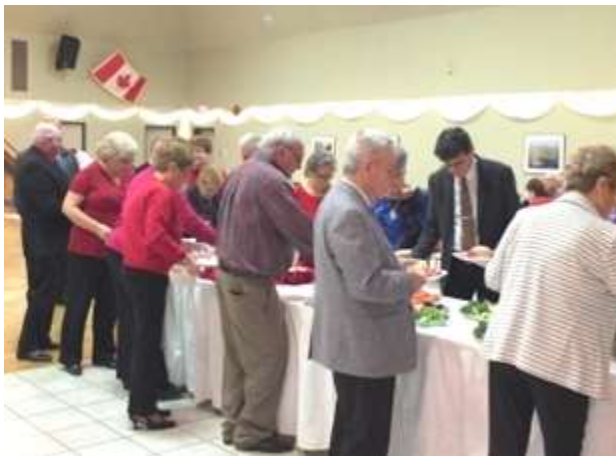
Guests select from a wide variety of dishes